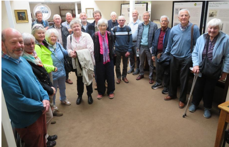
Photo shows that a good number of group members attended. Volunteers who run the museum gave an expert history of Rothamsted and then explained the items on display.